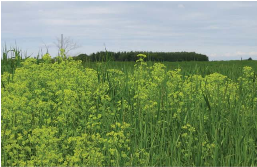
Leafy spurge is a deep-rooted perennial that grows in dense patches.