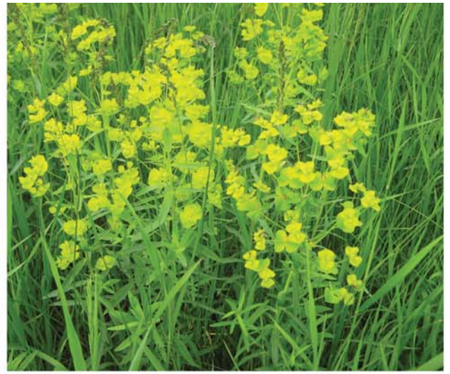
Stems have numerous narrow green leaves.