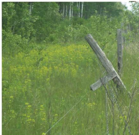
Herbicide along roadsides can be an effective means of control.