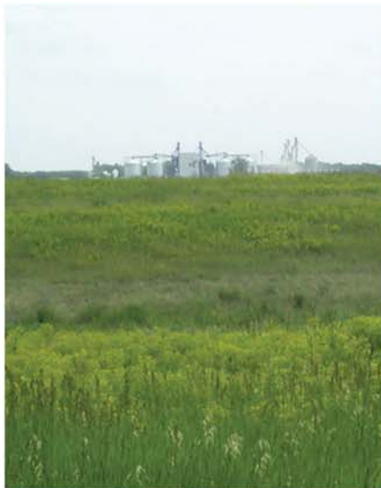
Seeds can float, enabling infestation along waterways.