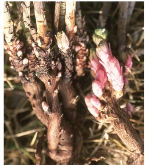
This plant is able to regrow quickly vegetatively from the pink buds on the root after being cut off by mowing or other disturbances.