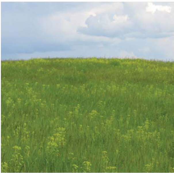
Ripening seedpods can explode, sending seeds up to 5m from the plant and aiding spread.