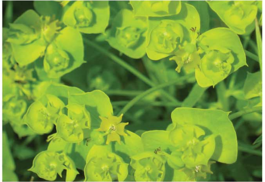
While the flower bracts are showy, the flowers are inconspicuous.